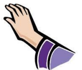
Anointing the sick